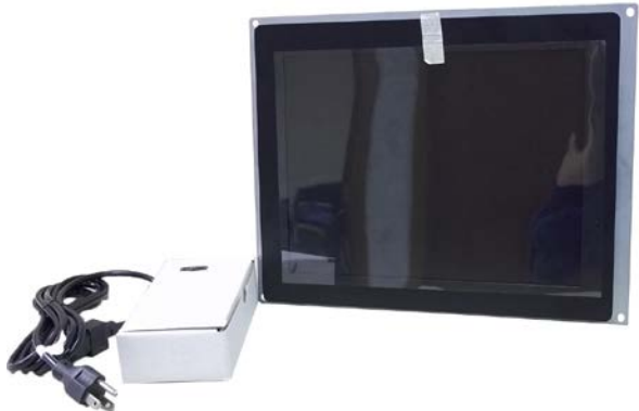
View (New Flat Panel Monitor and Power Supply)