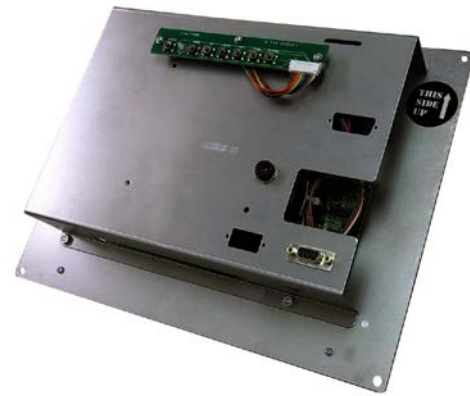
Back View (New Flat Panel Monitor)