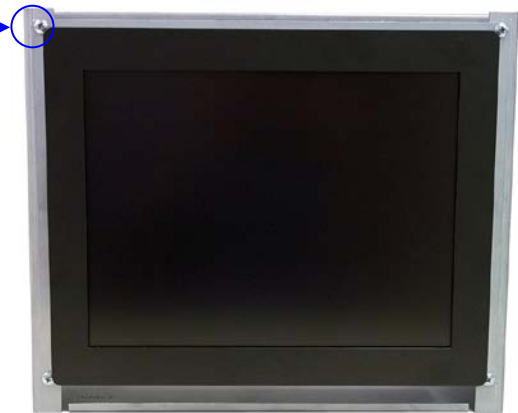
Mount Flat Panel Monitor to Chassis using screws from CRT mounting.