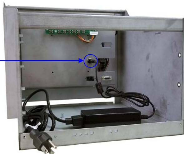
Plug Power Supply into Flat Panel Monitor.