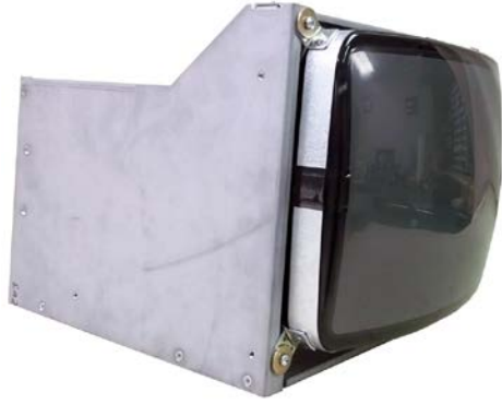
Side View (CRT Monitor)