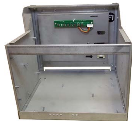
Rear View (Flat Panel Monitor) in Chassis