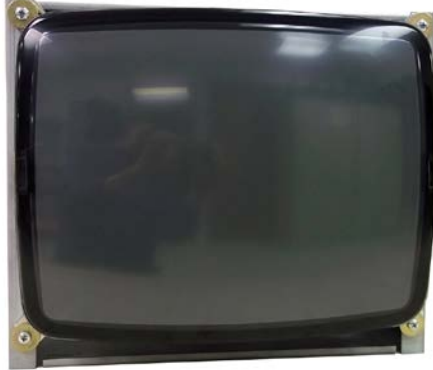
Front View (CRT Monitor)