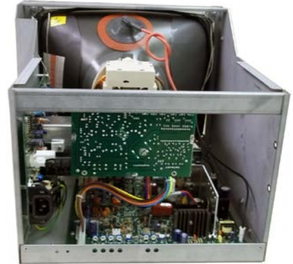
Rear View (CRT Monitor)